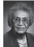
Frankie Muse Freeman