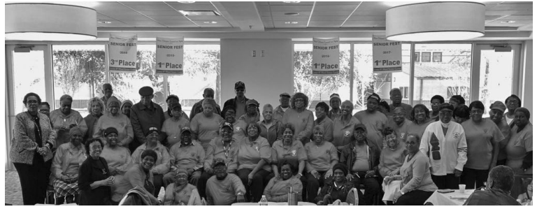
Senior residents in New Orleans participate in W.I.S.E. PEARLS Program.

tional and lifestyle altering for women. Engaging the volunteer services of the Chapter's Health and Wellness Committee, the program involved training persons to serve as wellness coaches and facilitators to provide counseling for depression,