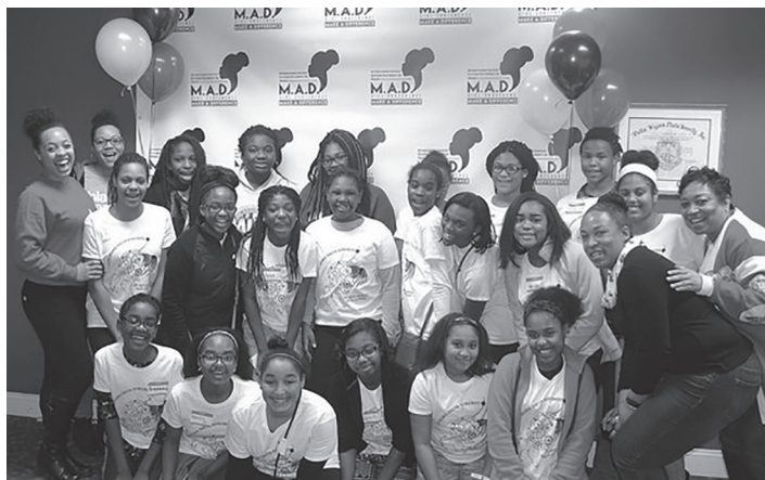
Conference participants and a few Delta members are pictured at the 2016 M.A.D. Conference sponsored by Baltimore Alumnae.

The Baltimore Alumnae Chapter of Delta Sigma Theta Sorority, Inc. received a 2016-17 Community Empowerment Grant to support its annual M.A.D. (Making A Difference) Conference, a signature event within its award-winning Delta Academy and Delta GEMS youth programs. The Conference aims to motivate young ladies between the ages of 11-17 to make better choices earlier in life that not only shape their future, but make a difference in the world.