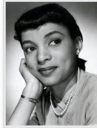
▲ Ruby Dee.

forth by the benefactors along with the Ruby Dee and Ossie Davis family. Going forward, the $1,000 merit-based scholarship will be awarded annually to a deserving African American female student who is either a junior or senior collegiate or a graduate student majoring in English, Literature, Drama, Art, Music African American Studies, Communications, Education, Fine Arts, Performing Arts, Visual Arts who also meets the permanent residency requirement of living in the DST Southern or Eastern Regions.