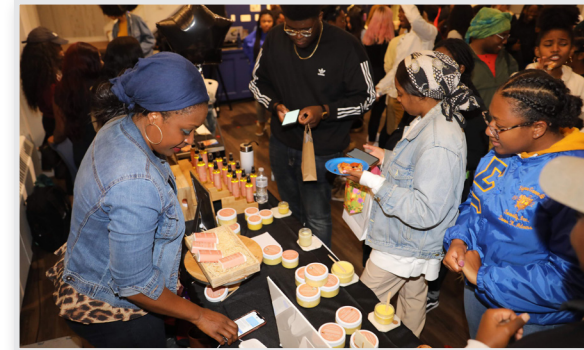
▲ Xi Tau Pop-Up Shop

The program far exceeded the Chapter's expectations. Planning next year's Pop Up Shop event includes opening up the event to neighboring educational institutions to build larger audiences for the local, Black-owned businesses. In addition, the Chapter plans to partner with Tufts' Africana Center to create a local registry of Black-owned businesses along with involving the university's department of Entrepreneurial Leadership to access additional funding to bring in more industry-diverse Black entrepreneurs.