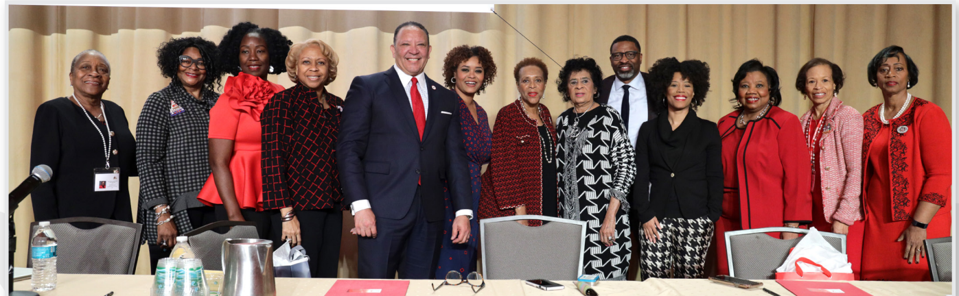
STJ Forum participants and guest panelists at Delta Days in the Nation's Capital.