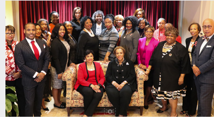
▲ DREF Board Members 2019-2020