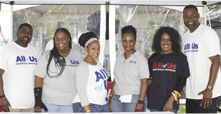
▲ Members of the All of Us Consortium: DREF Research Matters, Black Greek Letter Consortium (BGLC) and Emory University represent the All of Us Research Program during the 2019 Atlanta Greek Picnic at Morris Brown College in Atlanta, Georgia.