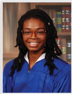
▲ Scholarship recipients awarded by San Antonio (TX) Alumnae.