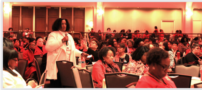
STJ Forum Attendees