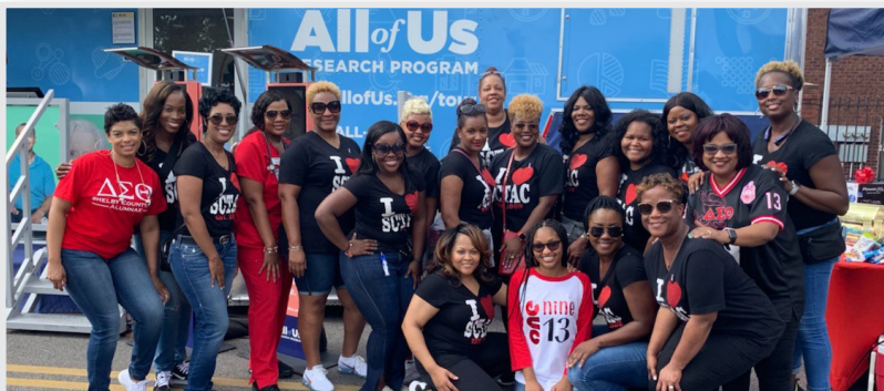
▲ Members of the Shelby County (TN) Alumnae Chapter of Delta Sigma Theta Sorority, Inc. collaborated with DREF Research Matters, the All of Us Journey, and Downtown Church Memphis for the 2019 Annual Fall Fish Fry.

various audience segments in a digital environment, on various platforms focusing on multiple program elements.