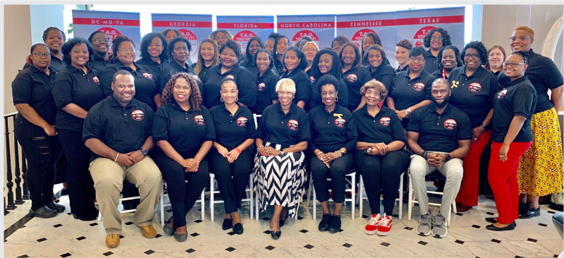
▲ DTEC-TAG Equity Warriors

next phase, called T.A.G. 2.0, is prepared to increase the number of community stakeholders willing to advocate for equitable educational opportunities for students. This second phase, launched in March 2020 and has partnerships with Delta Sigma Theta Sorority, Inc., and other organizations focused on education advocacy.