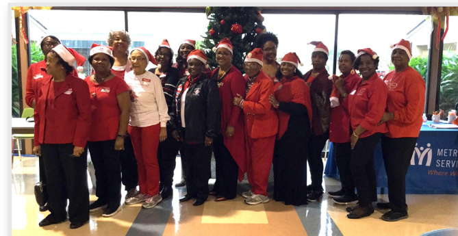
▲ W.I.S.E. P.E.A.R.L.S. Program of New Orleans Alumnae

Upon entering, every guest was asked to complete a pre-test to learn how many followed, or knew about healthy life choices. More than 80 completed the pre-test