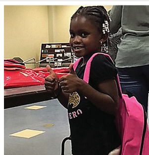
▲ New backpack filled with school supplies, compliments of NMAC.

The North Manhattan Alumnae Chapter (NMAC) of Delta Sigma Theta Sorority, Inc. was awarded a 2016-2017 Community Empowerment Grant to support its Annual Health Fair and “Backpack Jam” held in the fall of 2016 at the J. Hood Wright Park, New York, NY. The community outreach program not only offered backpacks filled with school supplies to students under age 18, but also served as a resource fair. Health screenings and voter registration were offered at the event along with healthy snacks, salsa dancing, games and music. Students and their parents also visited the health exhibitions, learned about the value of good nutrition, and attended the technology workshop.