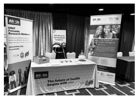
Join the DREF Research Matters Team to conduct outreach at informational displays throughout the

Houston, TX Memphis, TN Nashville, TN New Orleans Portland, OR Sacramento, CA