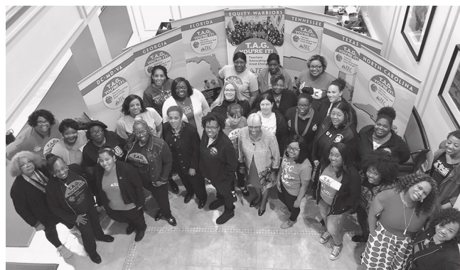
DTEC trained educators participated in the final training session of the TAG Policy Institute on April 5-7, 2019 in Washington, DC.

The Delta Teacher Efficacy Campaign (DTEC) and Teachers Advocating to lead Great change (TAG) will present at the 5th Annual Professional Development Series (PDS) as the kick-off program for the Congressional Black Caucus Foundation Annual Legislative Conference on September 11, 2019 in Washington, D.C. This is the fourth year that DTEC, in collaboration with the American Federation of Teachers, has been invited to