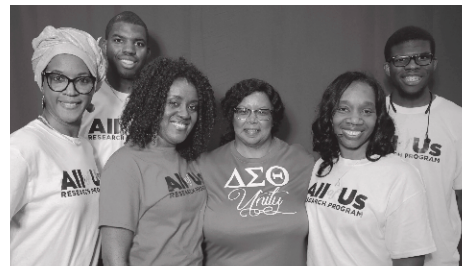
DREF Research Matters at Columbia, SC Expo event, May 2019.

DREF recently completed its second year of outreach activities of a three-year period as a national community engagement partner of the National Institutes of Health (NIH) All of Us Research Program. Through the initiative, DREF Research Matters: Creating Possibilities to Achieve Health and Wellness for All of Us , the Foundation, has created awareness and educated African Americans about the importance of biomedical research in closing the health disparity gap and shaping a better future for health care.