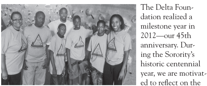
The Delta Foundation awarded a program grant to Stone-Mountain-Lithonia Alumnae Chapter to support is EMBODI program during the past fiscal year 2011-12.

where we invite 1,000 Delta members to contribute $100 and 100 Delta members to give $1,000 during this very special centennial year. With your commitment and support, our possibilities and programs are endless! Read more about the giving opportunities and our program activities throughout this newsletter issue.